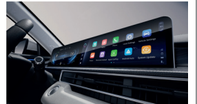
10.25" DUAL SCREEN